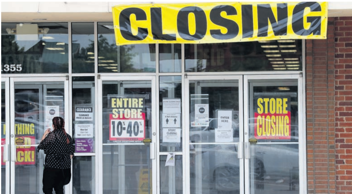
A woman walks into a closing Gordmans store, Thursday, May 28, 2020, in St. Charles, Mo.